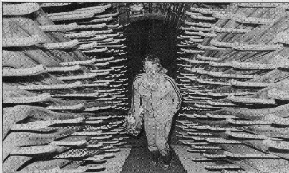
Stairs lead up from the deadly Euston tunnel to the Holborn tunnel.

Close at hand, shafts GA and BC, complete with lift, now emerge in Holborn Telephone Exchange, and the entrance to this building is a mere 30 yards from our Great Turnstile offices. This geographical good fortune has already been communicated to other staff, and plans are in hand for commandeering the place as a People's Nuclear Shelter (with especial reference to journalists) should the Worst happen, or be thought likely. Until then, our handy Holborn shafts provide convenient access to