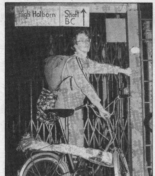
The lift in shaft BC emerges just a few steps from the door of the NS off High Holborn.

A right turn into Tunnel M offers the prospect of a jaunt a hundred feet below Drury Lane. A little sign indicates that Fleet Street's